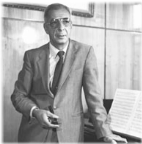
Mikael Tariverdiev (1931-1996)

The University of Kansas Division of Organ and Church Music Bales Organ Recital Hall 1600 Stewart Drive Lawrence, KS 66045 Phone: 785.864.2797