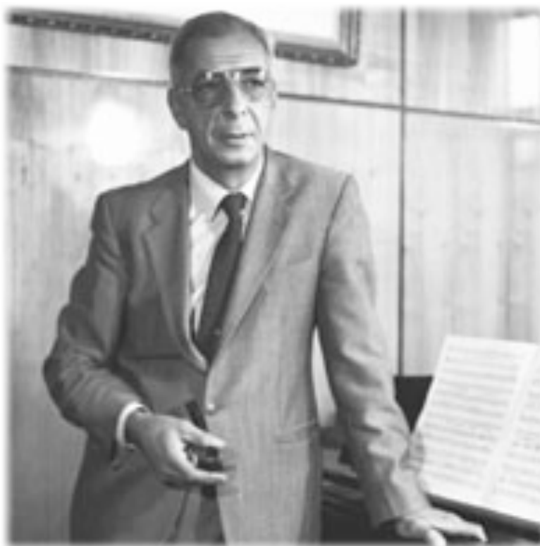
Mikael Tariverdiev (1931-1996)