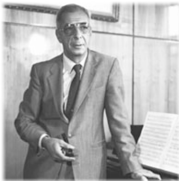
Mikael Tariverdiev (1931-1996)

The University of Kansas Division of Organ and Church Music Bales Organ Recital Hall 1600 Stewart Drive Lawrence, KS 66045 Phone: 785.864.2797