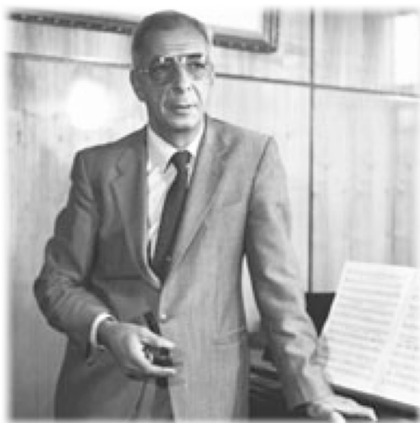
Mikael Tariverdiev (1931-1996)

The University of Kansas Division of Organ and Church Music Bales Organ Recital Hall 1600 Stewart Drive Lawrence, KS 66045 Phone: 785.864.2797